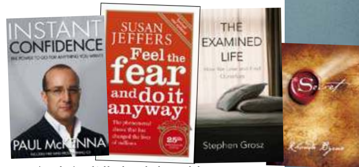
Here is a selection of Self-Help Books that may help.